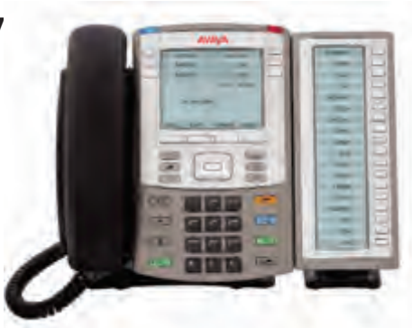
1100 Series Expansion Module with 1140E IP Deskphone

Leverages the award-winning sleek ergonomic design of the 1100 Series IP Deskphones for reduced desktop footprint